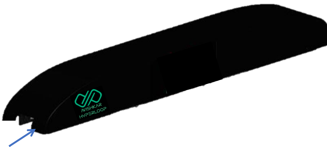
Pod View in Event